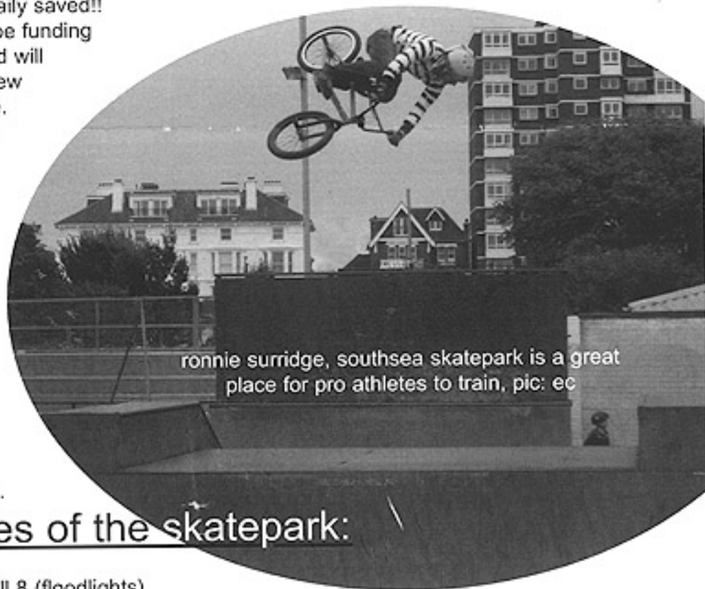
ronnie surridge, southsea skatepark is a great place for pro athletes to train

weekends 10 till 12 (coaching lessons available both days-as well as normal sessions) £2.30 12 till 6 £5; or 12 till 3 £3.50, 3 till 6 £3.50